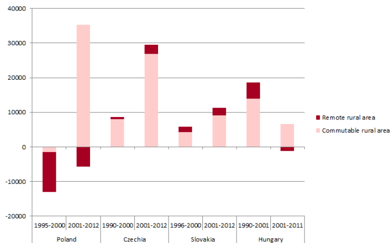
Figure 2.: The yearly average migration balance of the commutable and remote rural areas of the Visegrad Group