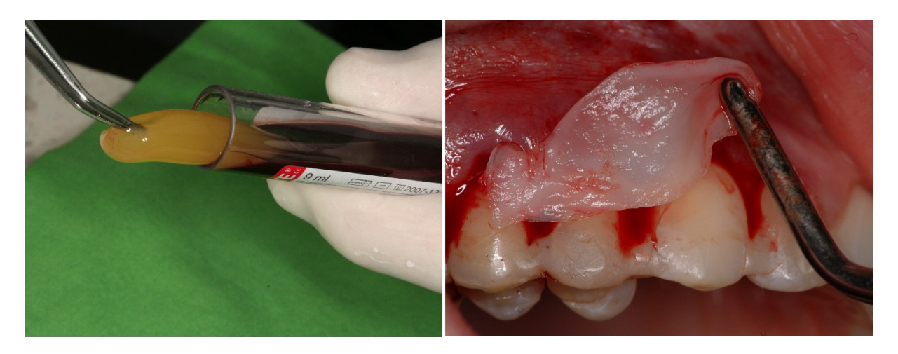
Figure 1. Plasma-rich fibrin clot being applied after centrifugation

The fibrin clot was easily separated from the lower part of the centrifuged blood and spread on a sterile gauze. A dry gauze was then folded over the PRF, which was stored in a refrigerator (4°C) until used.