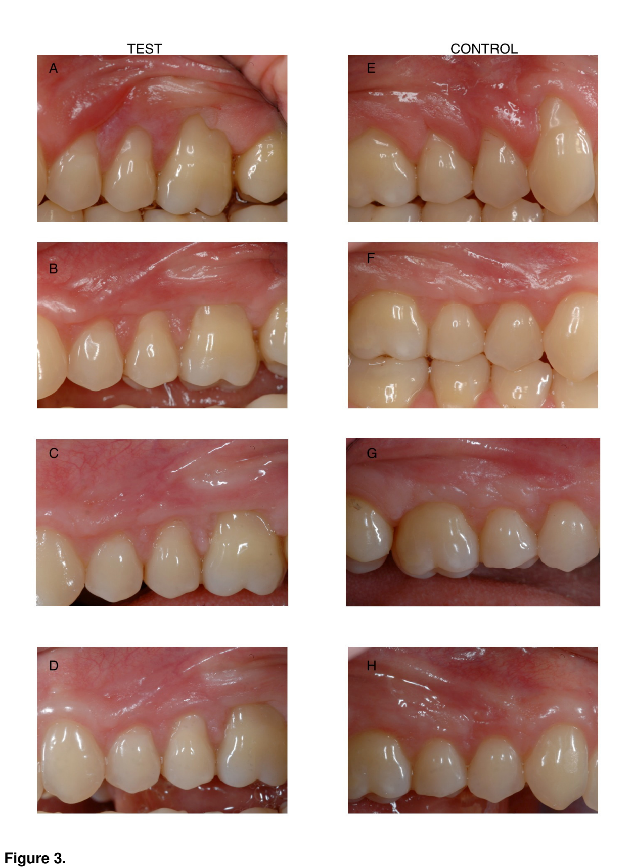
RESULTS OF TREATMENT OF MULTIPLE RECESSION-TYPE DEFECTS ON THE SAME PATIENT (TEST AND CONTROL). TEST SIDE. VIEW AT BASELINE (A) AND AT I(B), 3(C), and 6 months (D). Control side. VIEW AT BASELINE (E), and at I(F), 3(G), and 6 months (H)