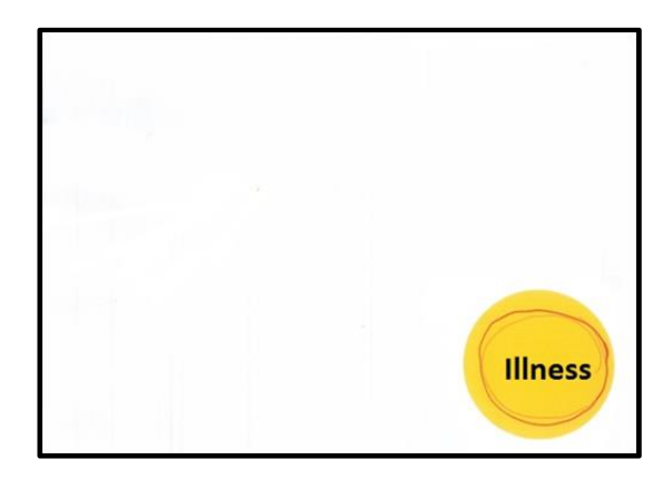
Figure 1b: PRISM-D drawing by a 31-year-old woman with breast cancer. The illness circle is within the self, SIS=0, the size of the illness is smaller than the self, but larger than the avarege size.